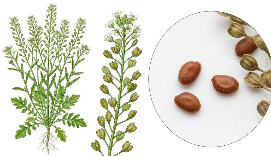
Figure 1 Lepidium sativum Plant and Seeds

results. The seeds contain high levels of alkaloids and saponins and flavonoids which provide them with medicinal properties that exhibit both antioxidant and antimicrobial effects.