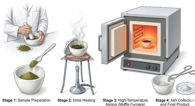
Figure 2 Dry Ashing Method for Sample Preparation

This is a way of preparation that reduces the interference of the matrix and provides correct quantification of the trace elements. It aligns with the standard procedures in mineral analysis of plants, where organic elements need to be fully digested to accurately determine the elements [5] The process was based on the earlier reported procedures on Lepidium sativum and other comparable plant materials with some modifications on the sample weight and the volumes of the reagents to suit the seed analysis [8]