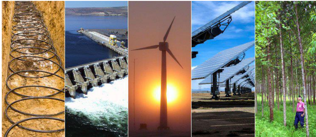
Figure 1 Renewable energy technologies.

All the electricity generated from the renewable energy technologies is also the major reason for reduction of Co2 emissions [3].